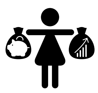
Figure 3. Separation of personal and business funds

What is a budget? A budget is a spending plan. Budgeting is a process that helps estimate the amount of money that will be spent for required needs as against your income. Preparing a budget helps you to be conscious of the use of money for your personal needs and your business.<sup>23</sup>