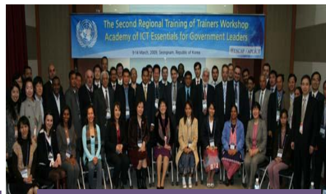
2 nd Training of Trainers