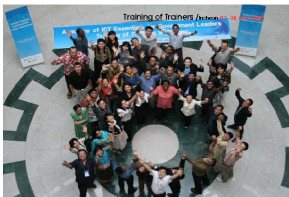
1 st Training of Trainers