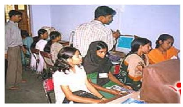
Fig. 1. Rural computer lab

department, rural schools have improving its infrastructure facilities. But the development is not uniformly in all rural areas; still many areas are neglected from even basic infrastructure facilities. Though, governments are providing ICT facilities to rural schools. Many of them are not working properly. The reasons such as, lack of accessibilities of the facilities by the beneficiaries, beyond the level knowledge of users and not full fill their needs or beyond their level of needs. Thus, whenever implement the ICTs related programmes in the rural areas, should be assess local conditions and priorities needs of rural students. The assessment of needs should be following the methods of dialogue, survey and discussion with beneficiaries in rural areas. First they have to understand the real benefits of the programme then only it will sustain in long term and perform effectively in rural areas.